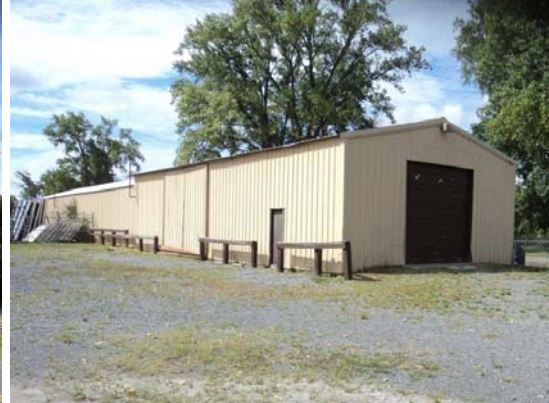
Additional Storage Bldg. on Site Included